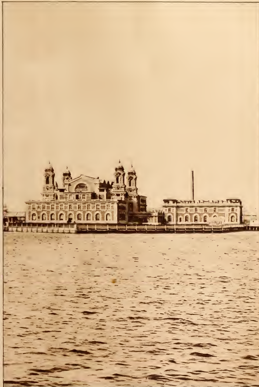
ELLIS ISLAND, to which all immigrants are taken for examination before landing.